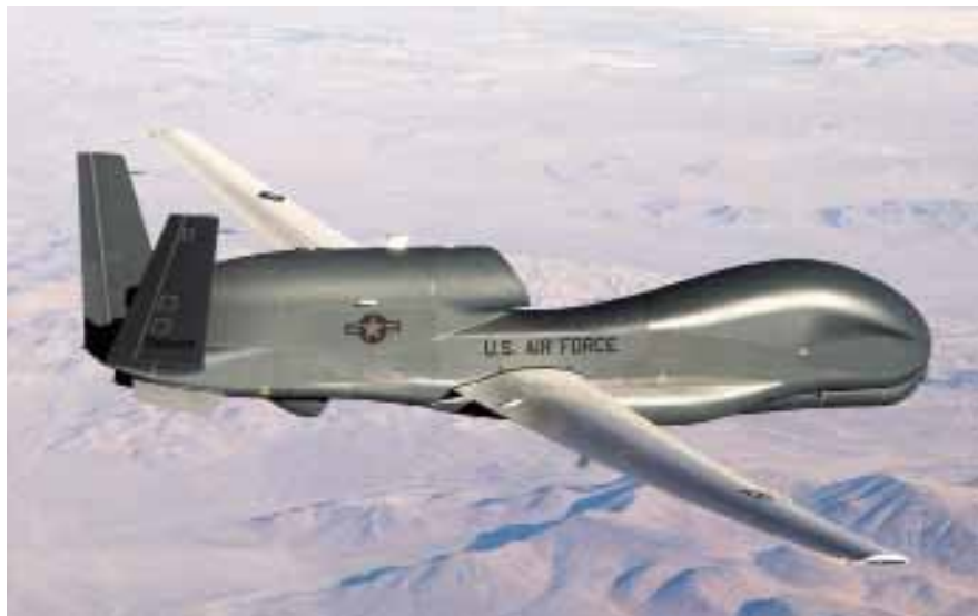
RQ-4 Global Hawk

The U-2 is the Air Force's premier high-altitude reconnaissance platform, capable of carrying Multi-int sensors