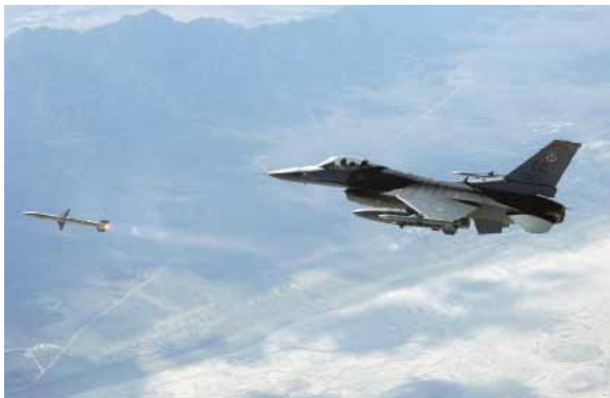
AGM-88 High-speed Anti-Radiation Missile

Brief: The CBU-87 CEM is an area munition effective against light armor, materiel, and personnel and used