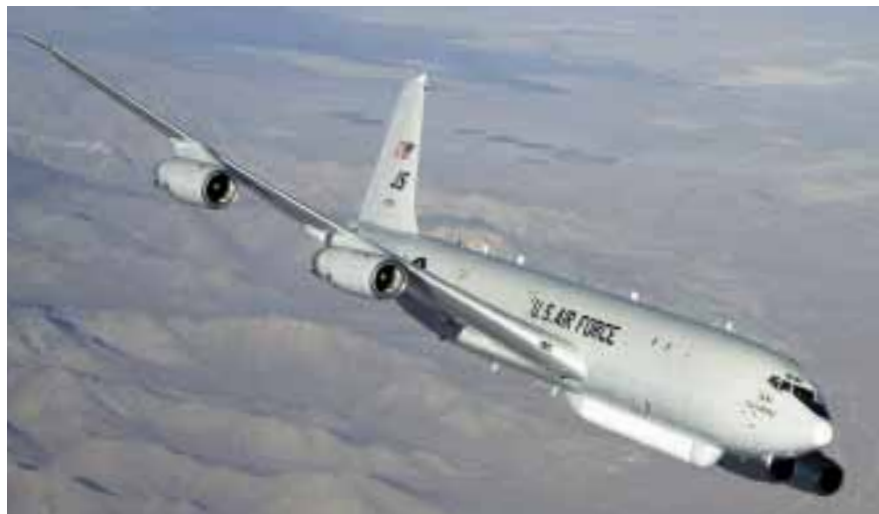
E-8C Joint STARS

Joint STARS (Surveillance Target Attack Radar System)