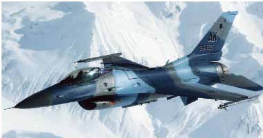
F-16 Fighting Falcon

F-16CG Block 40/42 aircraft specialize in night attack operations with precision guided weapons. Follow-on improvements include ALE-47 improved defensive countermeasures, ALR-56M advanced Very High Speed Integrated Circuit (VHSIC) technology in the APG-68(V5) fire-control radar, a ring-laser gyro INS, GPS, core avionics hardware, enhanced-envelope gunsight, digital flight controls, automatic terrain following, increased takeoff weight and maneuvering limits, an 8,000-hour airframe,