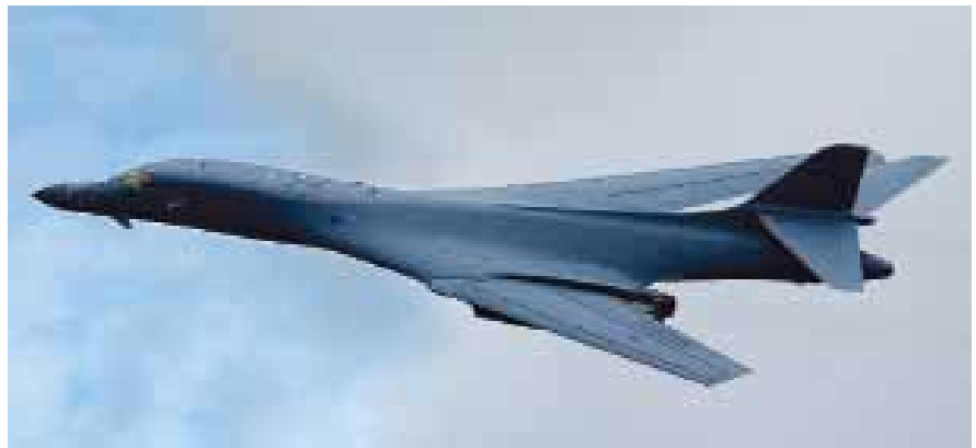
B-1 Lancer (Clive Bennett)

The B-1's onboard self-protection electronic jamming equipment, radar warning receiver (ALQ-161), expendable countermeasures (chaff and flare) system, and ALE-50