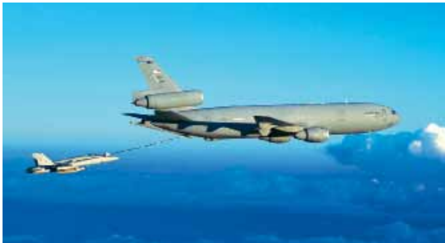
KC-10 Extender

Power Plant: (KC-135R/T) four CFM International F108-CF-100 turbofans, each 22,224 lb thrust; (KC-135E) four Pratt & Whitney TF33-PW-102 turbofans,