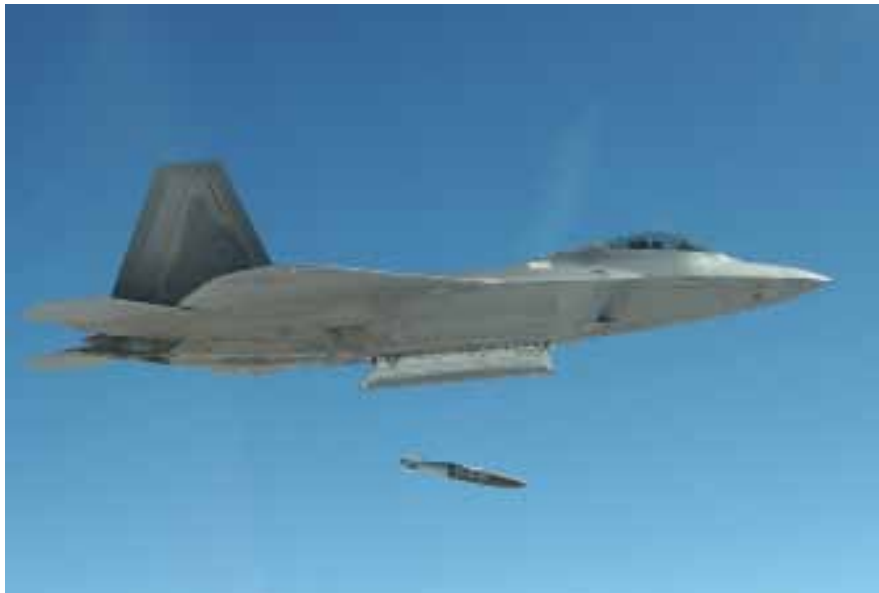
GBU-32 Joint Direct Attack Munition

WCMD. USAF is modifying standard SUU-64/65/66 tactical munition dispensers with guidance kits to compensate for wind drift on downward flight from high altitudes. The combat-proven WCMD kits include an INS guidance unit, movable tail fins that pop out in flight, and a signal processor. The kits, when fitted on CBU-87/89/97 inventory cluster weapons, are designated: CEM (CBU-103), Gator (CBU-104), SFW (CBU-105), and PAW (CBU-107). Successful flight testing began in February 1996; WCMDs are operational on A-10, B-1, B-52, F-15E, and F-16 aircraft. Objective aircraft include B-2 and F-35.