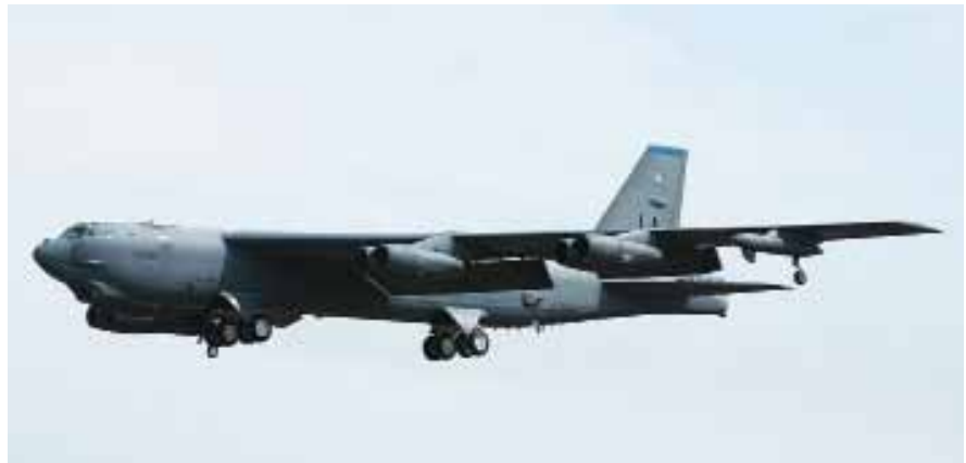
B-52H Stratofortress (Clive Bennett)

Armament: 12 AGM-86B Air Launched Cruise Missiles (ALCMs) externally, with provision for eight more ALCMs or gravity weapons internally. Conventional weapons incl AGM-86C/D Conventional ALCMs (CALCMs), naval mines, bombs up to 2,000 lb, CBU 87/89/97 unguided munitions, CBU-103/104/105 Wind-Corrected Munitions Dispenser (WCMD) guided munitions, GBU-31 and GBU-38 JDAMs, JASSMs, and GBU-10/12/28 laser guided bombs. Future weapons incl the Miniature Air Launched Decoy (MALD),