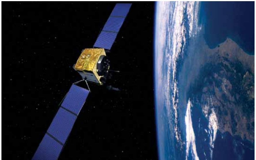
Global Positioning System IIF (Boeing illustration)

Constellation: five (III); 14 deployed/eight currently operational.