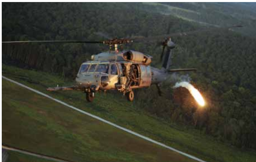
HH-60G Pave Hawk

TH-1H is a modified version of the UH-1H (Huey II kit) for use by the 23rd Flying Training Squadron (23rd FTS) at Ft. Rucker, Ala., for Air Force undergraduate