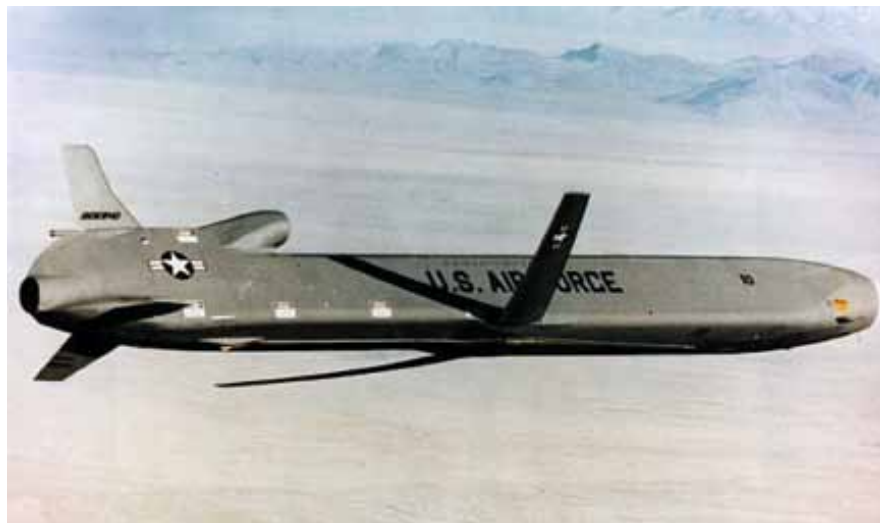
AGM-86 Air Launched Cruise Missile