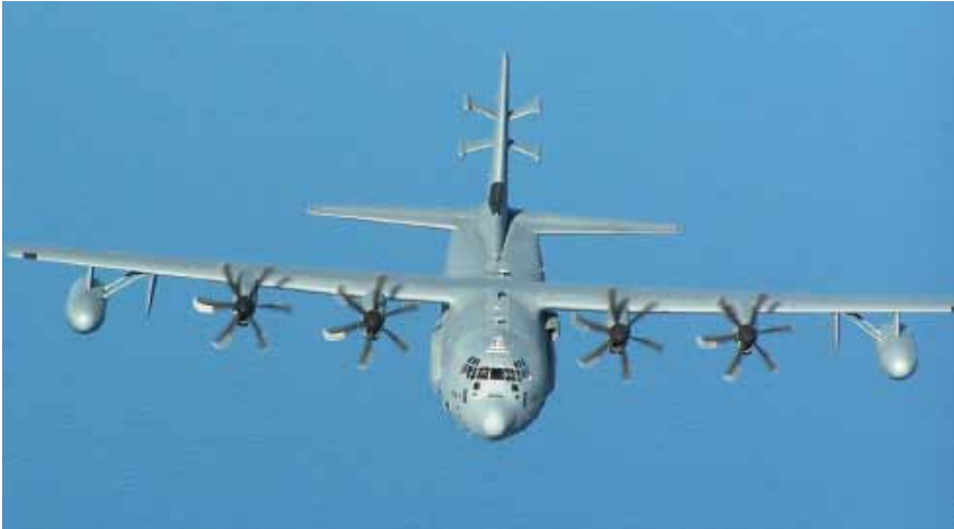
EC-130J Commando Solo II

is a commercial Boeing 707-300 series platform extensively remanufactured and modified with radar, communications, operations, and control subsystems. A 27-ft-long canoe-shaped radome under the forward fuselage houses the 24-ft long-range, side-looking phased air-to-ground radar capable of locating, classifying, and tracking vehicles moving on Earth's surface. The antenna can be tilted to either side of the aircraft to detect targets. Data is then transmitted via data link to ground stations or other aircraft.