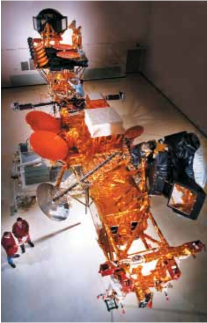
Milstar Satellite Communications System

life, faster processors, and a new civil signal on a third frequency. The first GPS Block IIF launch is scheduled for 2010. Future generation GPS III satellites will provide improved accuracy, availability, integrity, and resistance to jamming. Launch is slated for 2014.