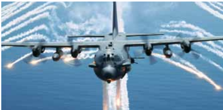
AC-130H Gunship

AC-130E , an improved version, of which eight were built. Converted to H standard after service in Vietnam.