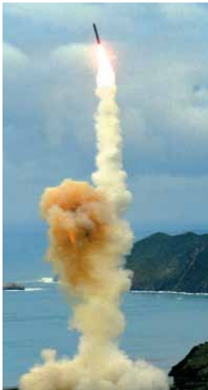
LGM-30 Minuteman III

A key element in the US strategic deterrent posture, Minuteman is a three-stage, solid-propellant ICBM, housed in an underground silo.