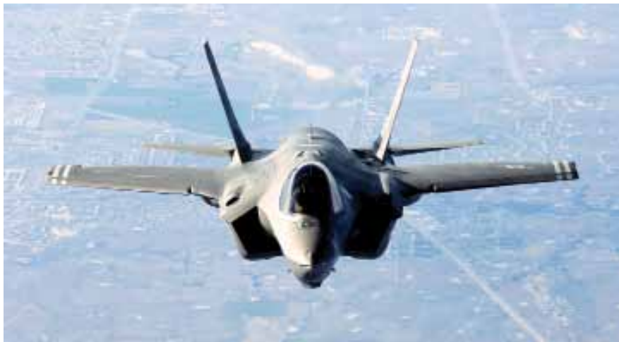
F-35 Lightning II

Accommodation: pilot only, on zero/zero ejection seat.