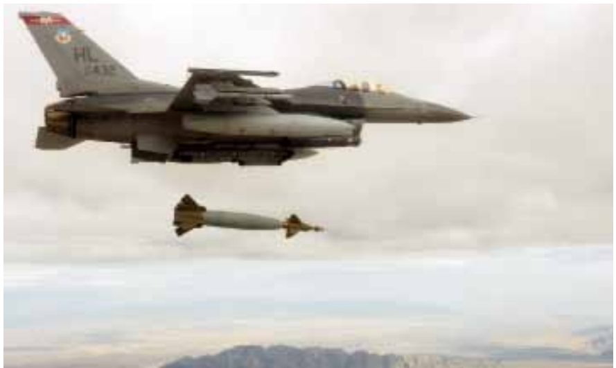
GBU-10 Paveway II