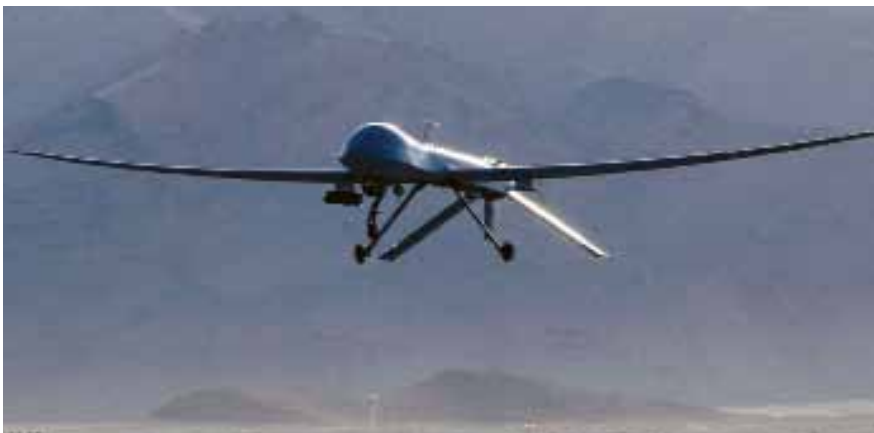
MQ-1 Predator