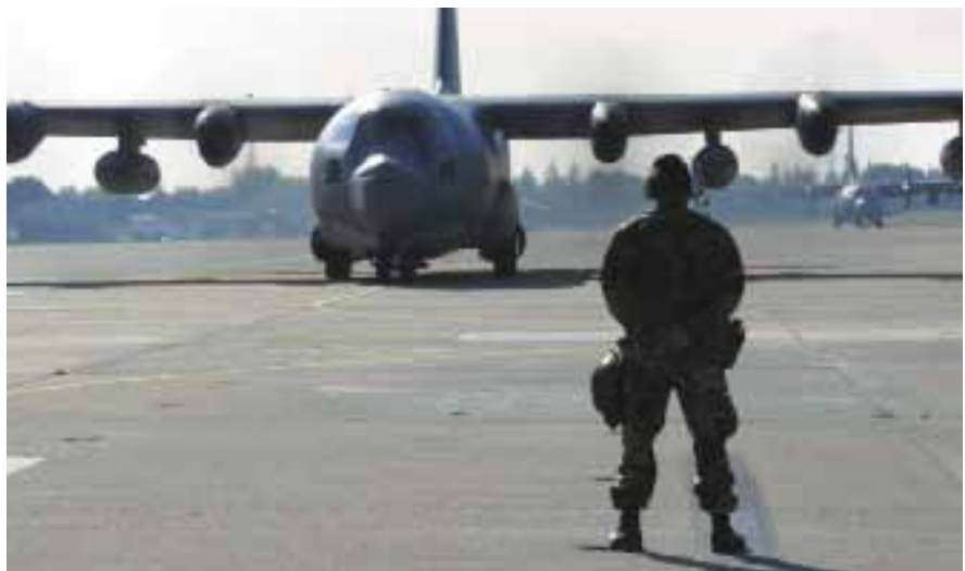
MC-130P Combat Shadow

MC-130P Combat Shadow aircraft fly clandestine formation or single-ship intrusion of hostile territory missions to