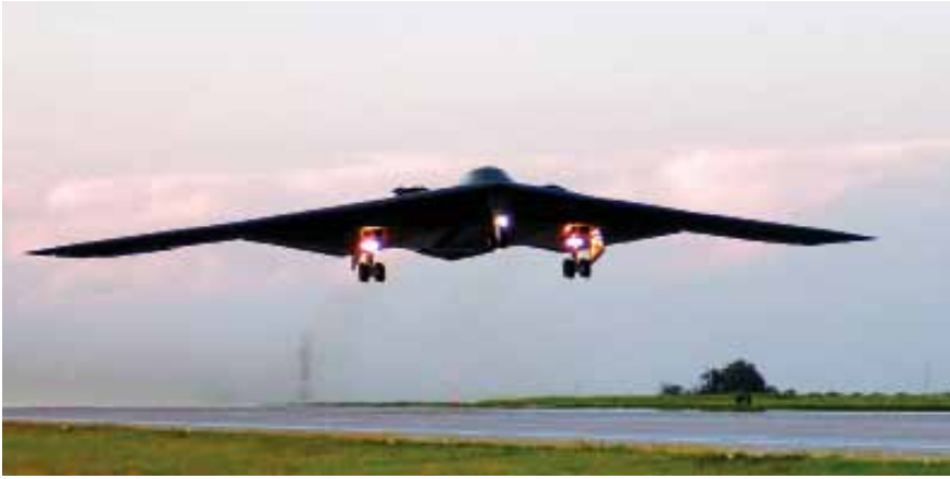
B-2A Spirit

flight-control system, actuating moving surfaces at the wing trailing edges that combine aileron, elevator, and rudder functions. A landing gear track of 40 ft enables the B-2 to use any runway that can handle a Boeing 727 airliner.