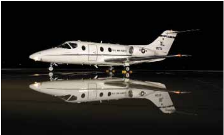
T-1A Jayhawk (Greg L. Davis)

The Joint Primary Aircraft Training System (JPATS) T-6A Texan II is based on the Swiss Pilatus PC-9 aircraft, modified to include a strengthened fuselage, zero/zero ejection seats, increased aircrew accommodation, upgraded engine, increased fuel capacity, pressurized cockpit, larger, bird-resistant canopy, and new digital avionics.