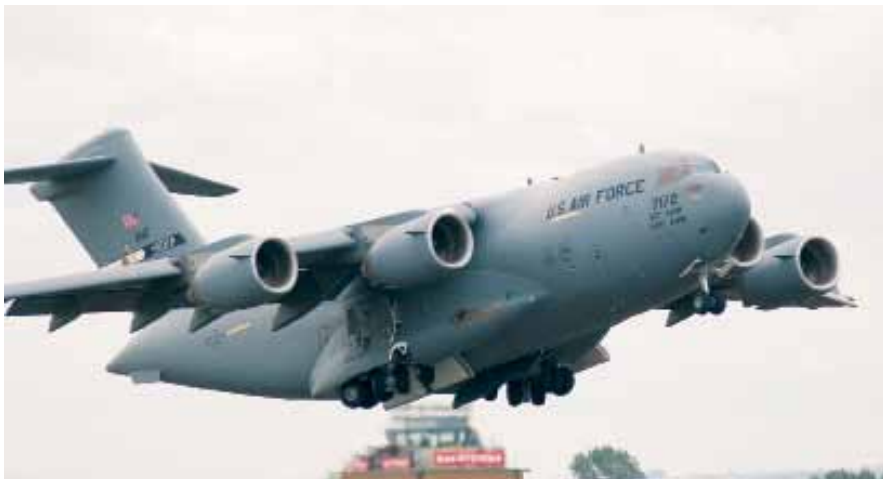
C-17 Globemaster III (Clive Bennett)

Performance: normal cruising speed 484 mph at 35,000 ft or 518 mph (Mach .77) at 28,000 ft, unrefueled range with 160,000-lb payload 2,760 miles, additional 690 miles with extended-range fuel containment system (ERFCS), unlimited with refueling.