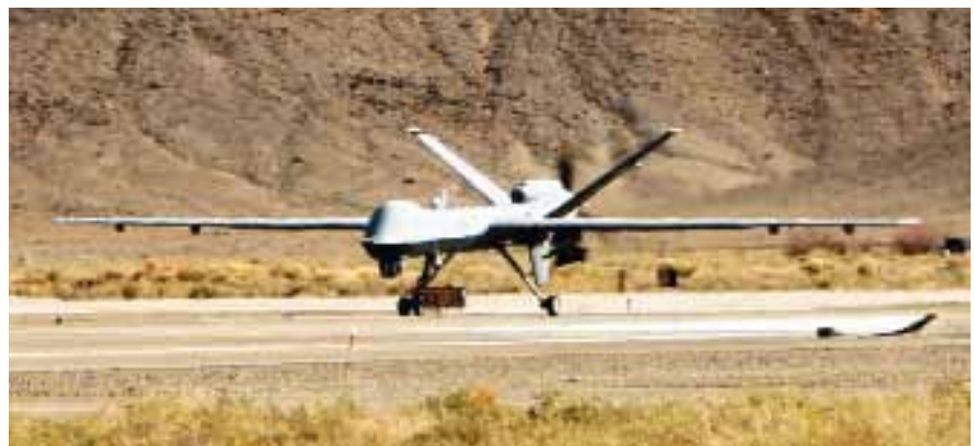
MQ-9 Reaper (Lawrence Crespo)

Function: Unmanned surveillance and reconnaissance aircraft.