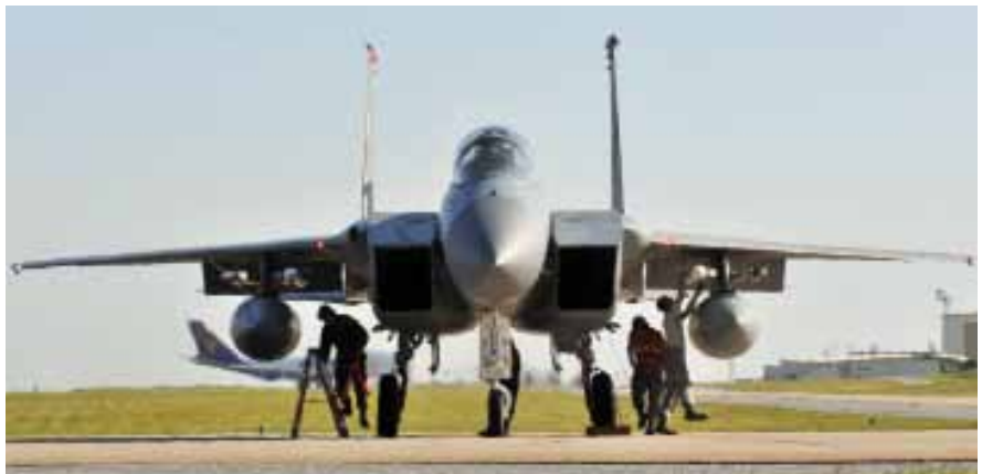
F-15C Eagle (TSgt. Rey Ramon)

Armament: one internally mounted M61A1 20 mm