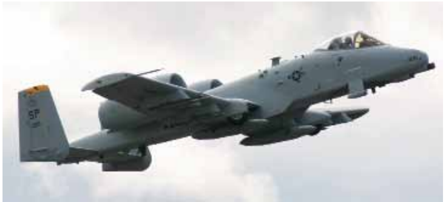
A-10A Thunderbolt II

Aircraft Location: Barnes Arpt., Mass., Eglin AFB, Fla., Great Falls Arpt., Mont., Jacksonville Arpt., Fla., JB Elmendorf, Alaska, JB Langley, Va., JB Pearl Harbor-Hickam, Hawaii, Klamath Falls Arpt., Ore., Kadena AB, Japan, Mountain Home AFB, Idaho, NAS JRB New Orleans, La., Nellis AFB, Nev., Portland Arpt., Ore., RAF Lakenheath, UK, Robins AFB, Ga., Tyndall AFB, Fla.