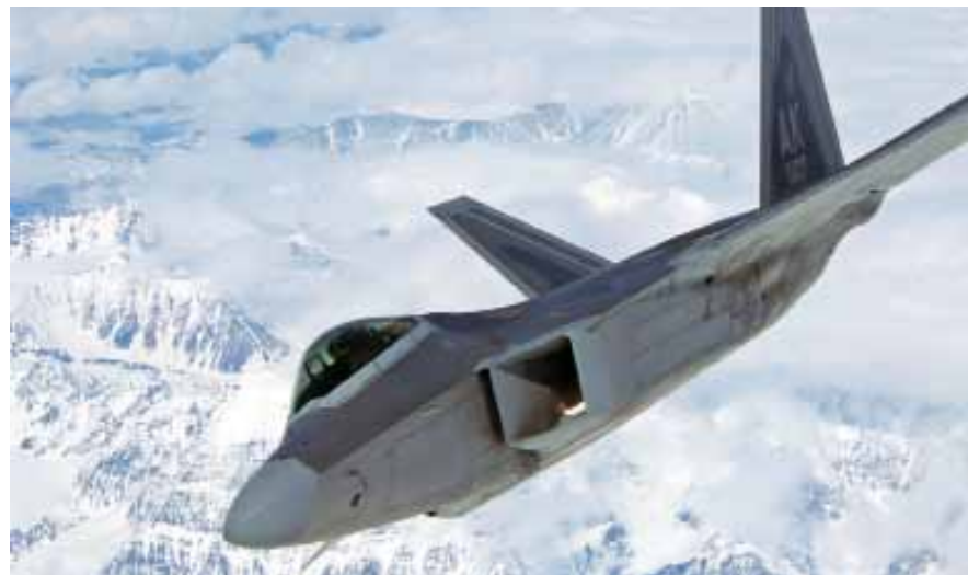
F-22A Raptor (SrA. Laura Turner)

Power Plant: two Pratt & Whitney F119-PW-100 turbo-